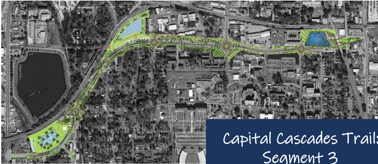
Capital Cascades Trail: Segment 3